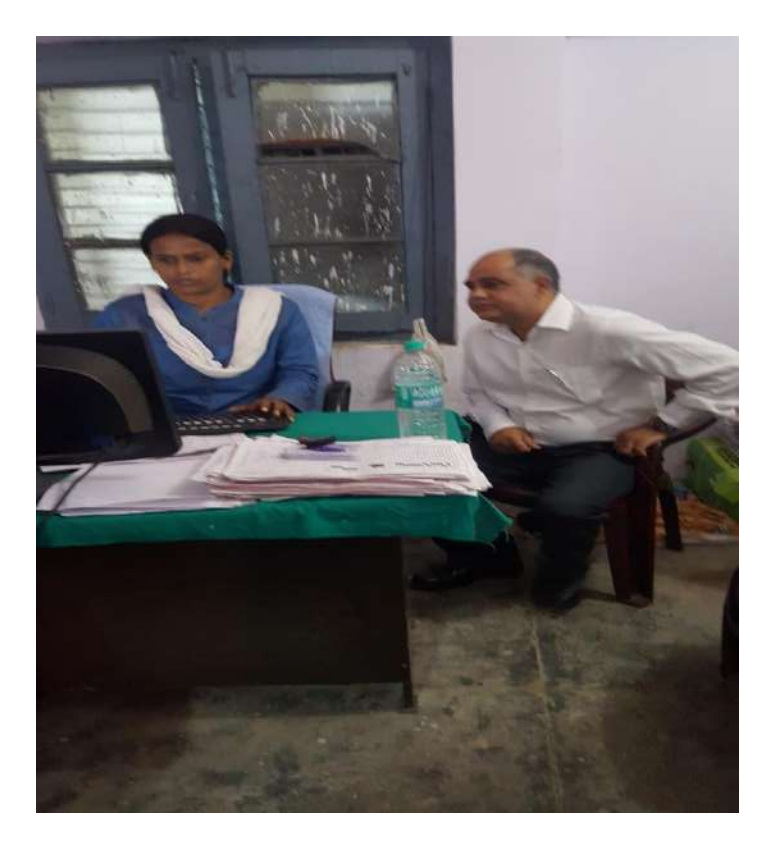
Fig. 9: HMIS data entry at the facilities

HMIS and MCTS were functioning well in the district. Data entry operators were recording the data from time to time. It was one of the plus points of the district as it helps maintained a record of the achieved status of various programs. MCTS portal helped to track anaemic women and child in the district, proper record was maintained and checking was done from time to time. Overall both HMIS and MCTS were working well in the district.