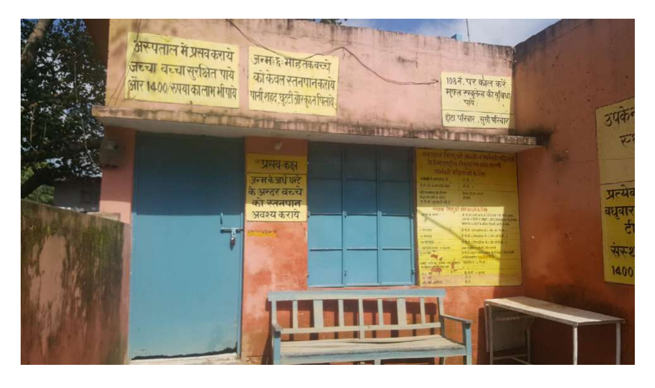
Fig 3: CHC Tulsipur

Proper bio-medical waste mechanism was functional in the facility. The Community Health Centre was functioning in a government building. Bio-medical waste mechanism was functional in the facility. There was no Nutritional Rehabilitation Centre available and no separate room for ARSH clinic.