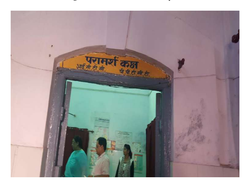
Fig 2: A Unit in Female District Hospital

There was different floor for each section of the facility such as Gynaecology, Paediatrics, Family planning and other sections. Table 5 shows that almost all the physical infrastructure facilities were available in the hospital. Provisions of staff quarters were not available for doctors. There was running water supply and electricity power backup in the hospital. One of the problems was unavailability of Nutritional Rehabilitation Centre.