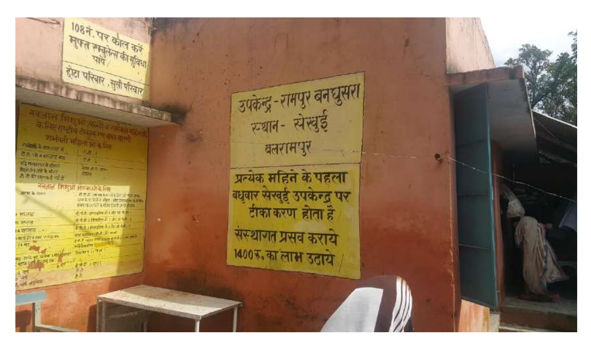
Table 9: Health Infrastructure of Sub Centre Banghusara