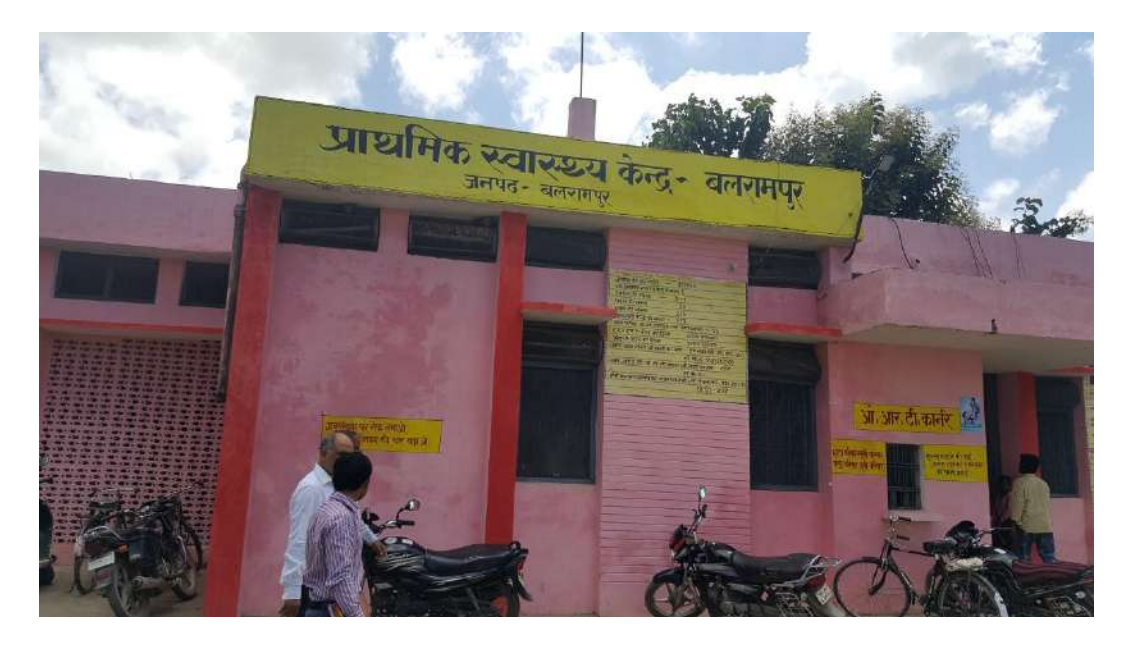
Table 7: Health Infrastructure of PHC Balrampur