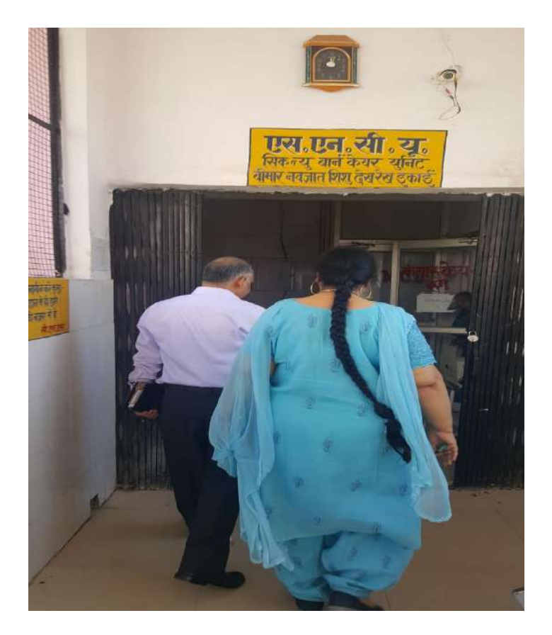
Fig. 7: SNCU at Female District Hospital

SNCU was present in District hospital was functionally well in the district as compare to other district. But more beds can be allotted to SNCUs to cater wider population in their respective areas.