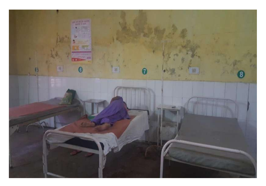
Fig. 6: Wards in the Female District Hospital

In some of the facilities shortage of equipment was seen.