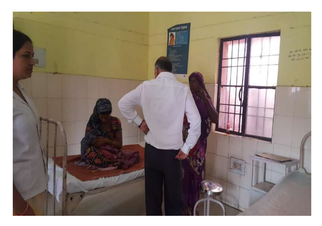
Fig. 7: Interviewing JSY Beneficiaries