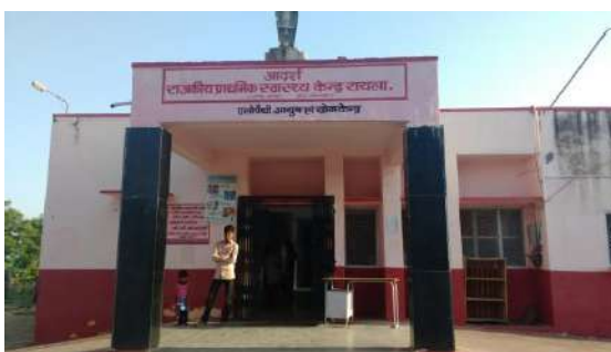
Figure 6: Community Health Center, Banera Block, Bhilwara District, Rajasthan

The CHC had come up with innovative ways to deal with regular problems faced by the facility, that is development of garden in the common area which creating an unhygienic situation. Similarly, cottage wards were developed so that private space could be provided to patients who could afford it, however, these did not have corresponding furniture to be functional. There is no ACs or invertors, which makes the place stuffy and humid with huge number of patients queuing in. Separate washrooms for Male and female patients, not very clean. Biomedical waste disposal and management was in place as the CHC had pits which were cleared regularly. All required drugs are fully stocked and proper records are maintained for drug stocks.