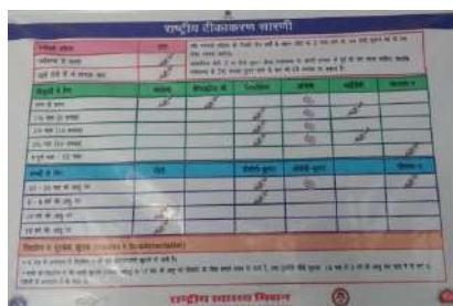
Figure 4: IEC Display at a facility in Bhilwara District

be used as a medium for awareness generation among the patients visiting should be displayed.