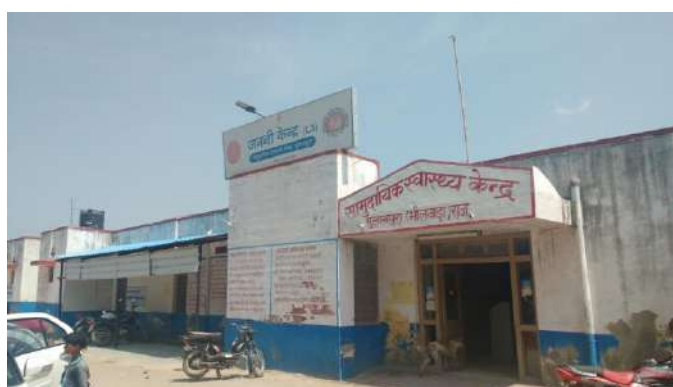
Figure 7: Primary Health Center, Gulabpura Block, Bhilwara District, Rajasthan