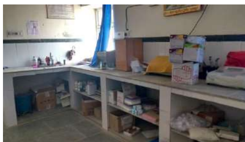
Figure 2: Blood bank at a facility in Bhilwara District