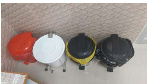
Figure 3: Colour Coded Waste Segregation at a Medical Facility in Bhilwara District

All the facilities had coloured bins to dispose-off bio medical waste. The waste disposal mechanism was running smoothly at all the facilities. In some facilities temporary cardboard box arrangements were being made for immediate waste disposal instead of using the designated bin for it. There were IEC materials displayed at all the wards in a facility regarding disposal of waste into different coloured bins. The biomedical waste was collected by outsourced contractors from CHCs and some PHCs, who collected waste every second day. Though some of the facilities did not have outsourced BMW disposal system, they had a pit to dispose of the waste, however these pits were old and had not been cleared for quite some time. During the visit it was also seen that certain sub-centers did not have a pit nor was their waste disposal being outsourced, hence they had to dispose off the waste in an unhygienic manner.