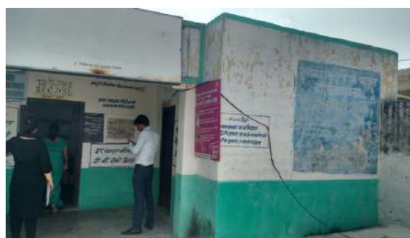
Figure 9: Sub-Health Centre, Padodas, Bhilwara District