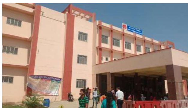
Figure 5: Mahatma Gandhi District Hospital, Bhilwara District

The State had come up with an innovative practice of Mother-Milk Bank where the volunteer lactating mothers were motivated to donate the surplus milk, which was hygienically stored to be used by children who were in need of it.