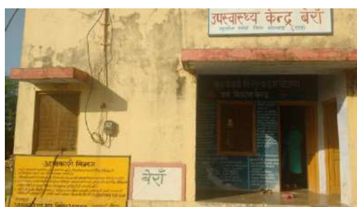
Figure 8: Sub-Health Centre, Bera Block, Bhilwara District, Rajasthan