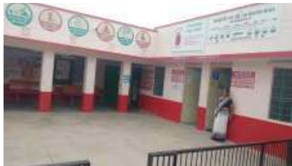
Figure 6: Health Infrastructure, PHC, Jhilai, Tonk District