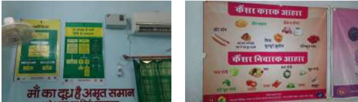
IEC on display at PHC

the main city to get packed lunches. Also, most of beneficiaries are locals and prefer home cooked food.