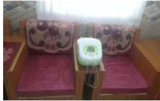
Mother Milk Bank