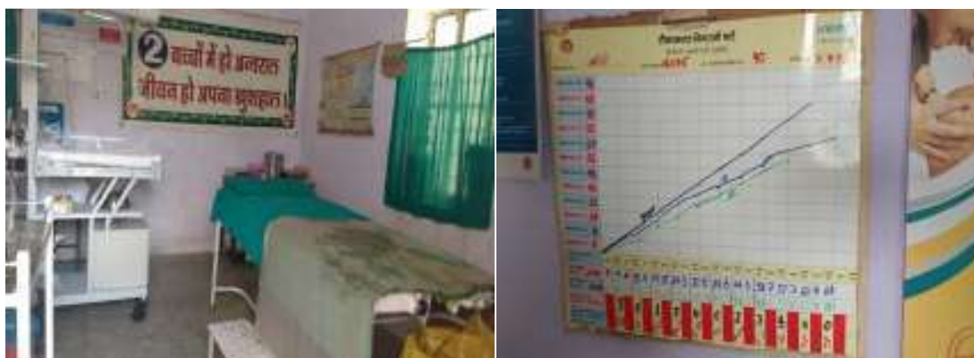
Figure 8: Health Infrastructure, SC, Baroni, Tonk District