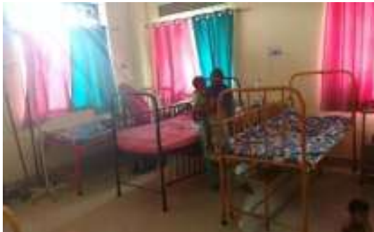
Malnutrition Treatment Centre (MTC)