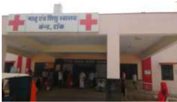
Figure 2: District Hospital