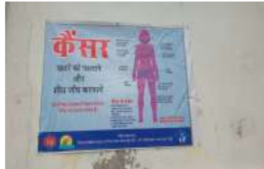
IEC on Display