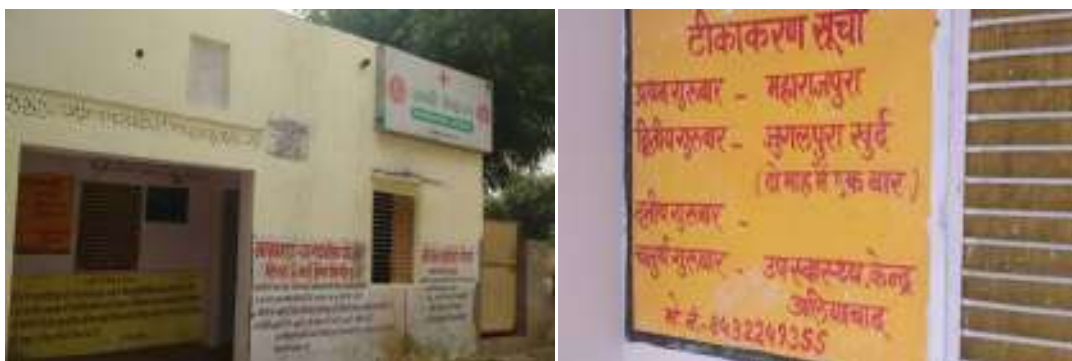
Figure 9: Health Infrastructure, SC, Aliyabad, Tonk District