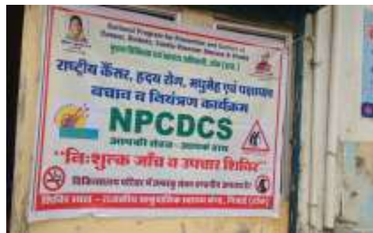
IEC on display at PHC