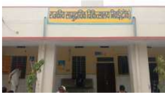
Figure 4: CHC Newai