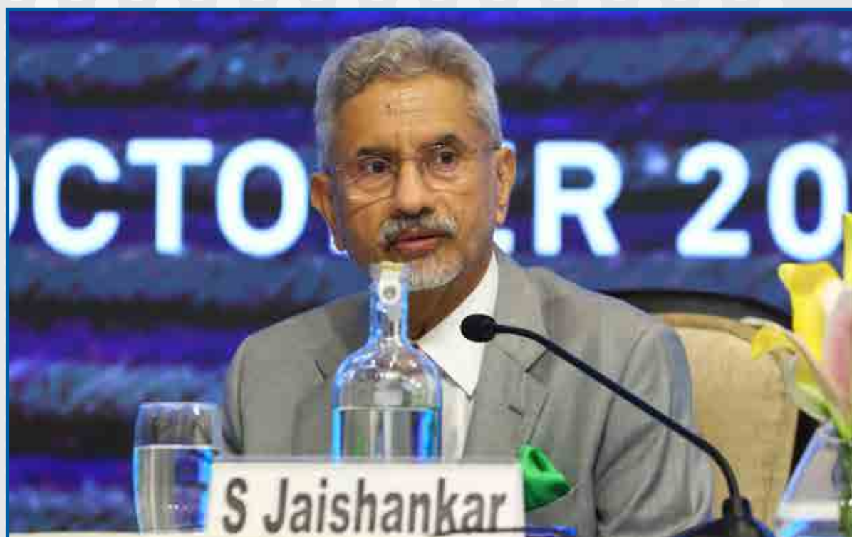
Hon'ble Minister of External Affairs, Dr. S. Jaishankar at KEC 2024- Concluding Remarks