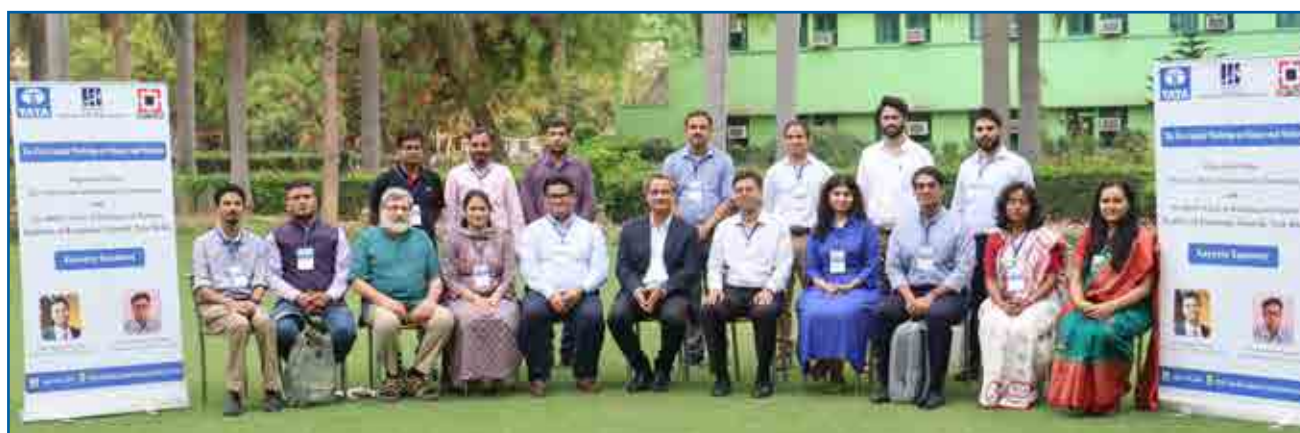
First Workshop on “Finance and Markets,” held on April 15–16, 2024