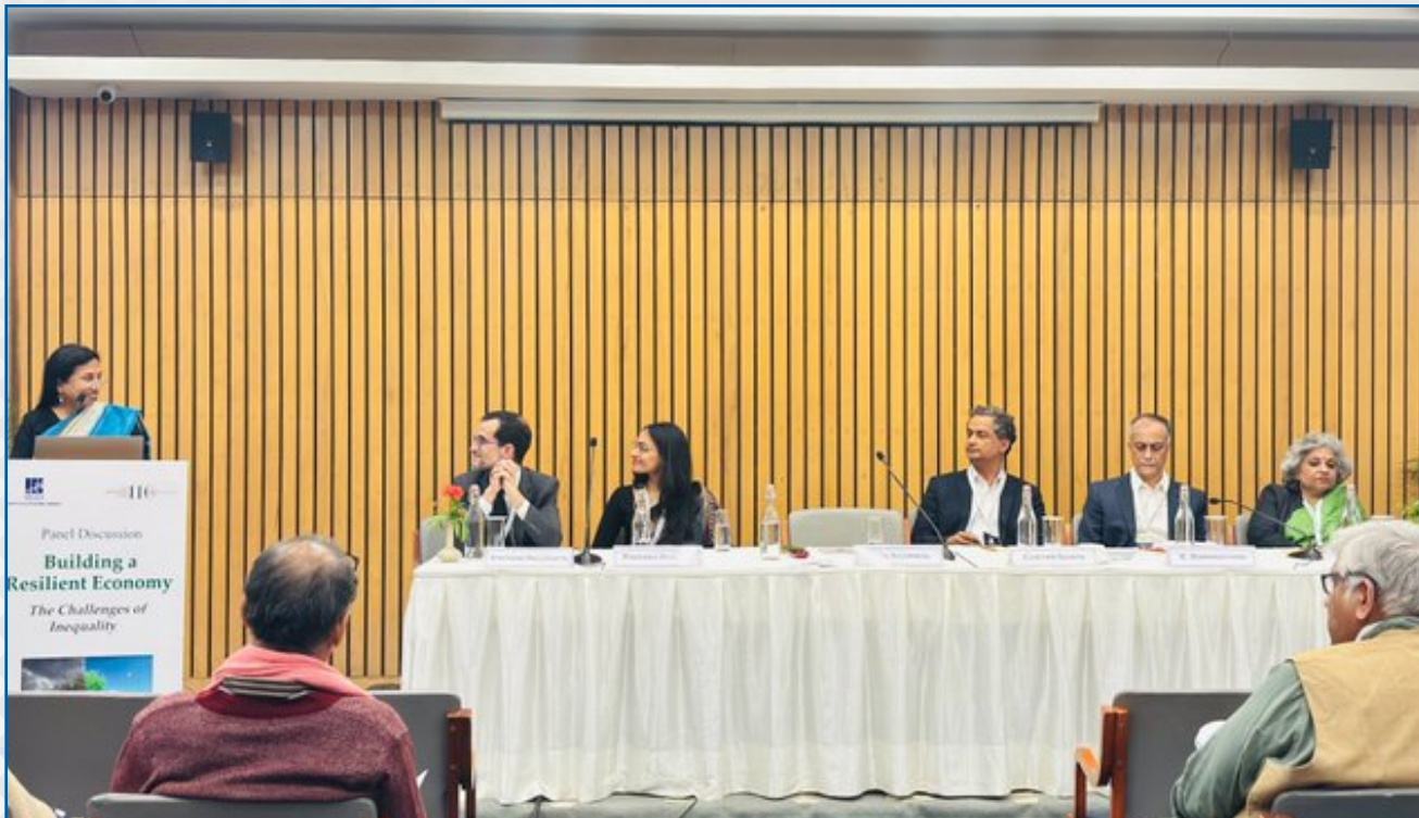
“Towards a Resilient Economy” Symposium organized on December 6-7, 2024.