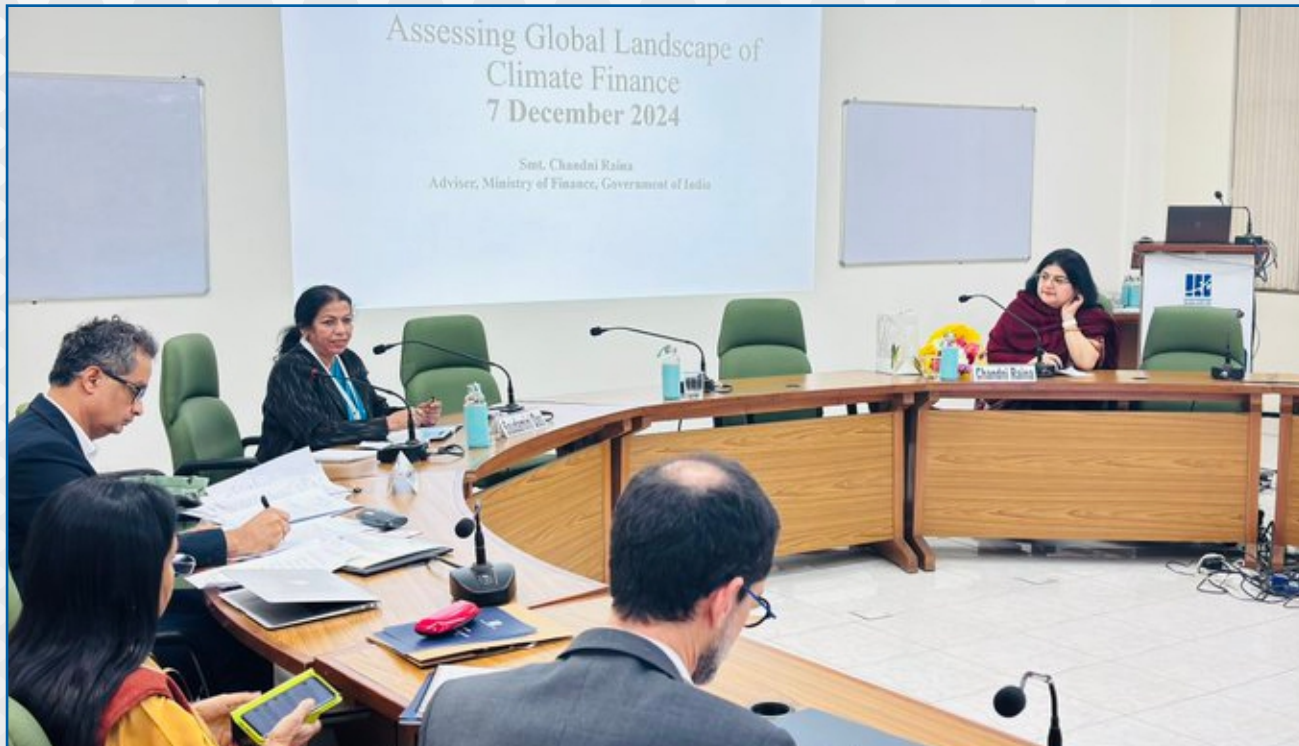
"Towards a Resilient Economy" Symposium organized on December 6-7, 2024.