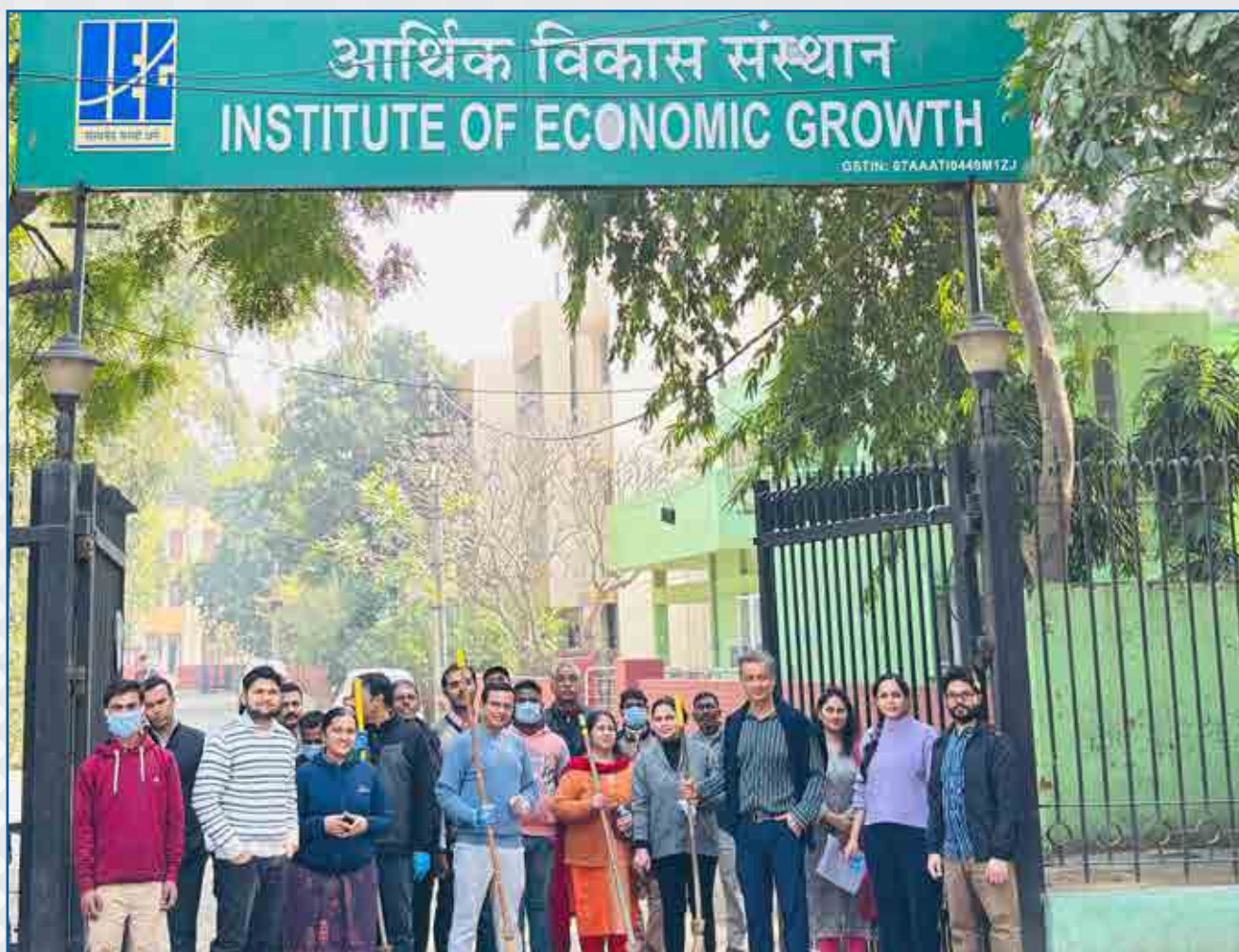
Cleanliness Drive was organised by IEG on January 23, 2025