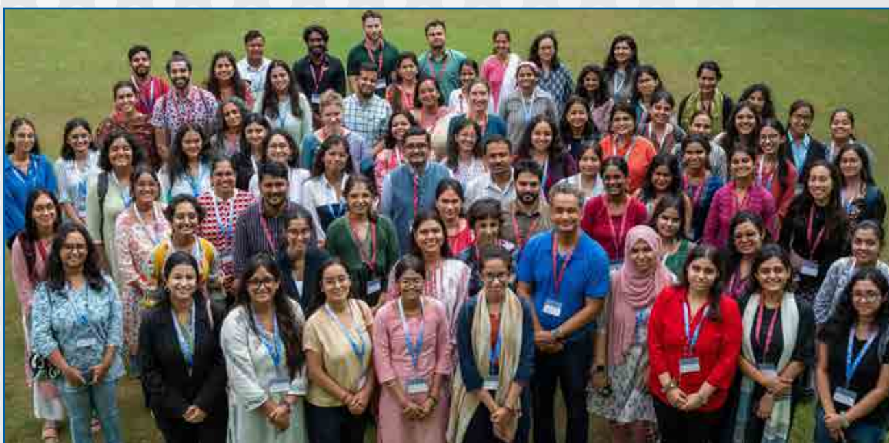
“Women in Leadership in Economics (WiL)” workshop organized in collaboration with Yale Inclusion Economics and Inclusion India Economic Centre on August 9, 2024.