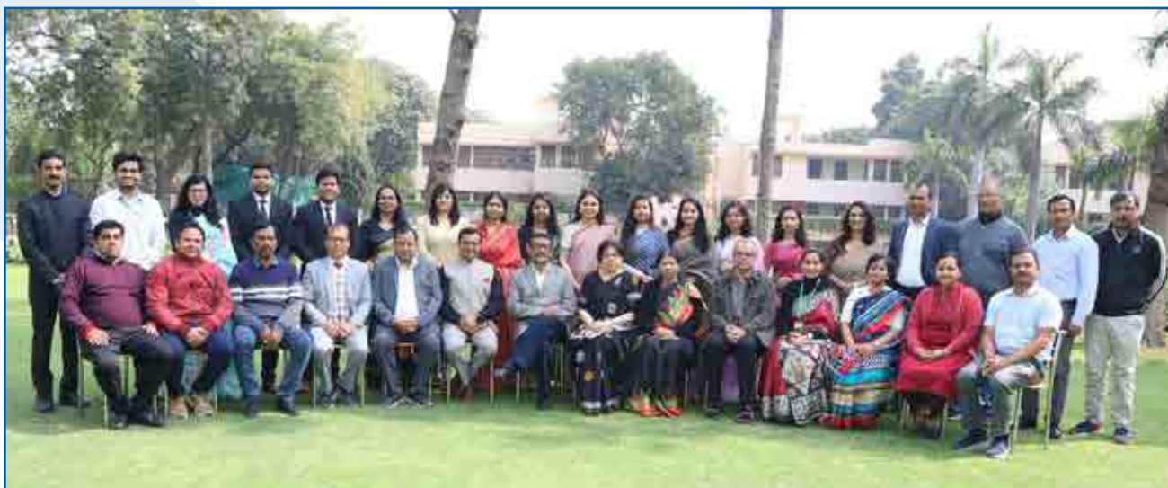
IES Batch 2024- Validictory Session

lectures and shared their experiences with the IES Officer Trainees. A total of 17 IES Officer Trainees attended the programme. During the probationary programme, Officer Trainees conducted research on contemporary economic policy issues under the guidance of IES Faculty and submitted seminar papers.