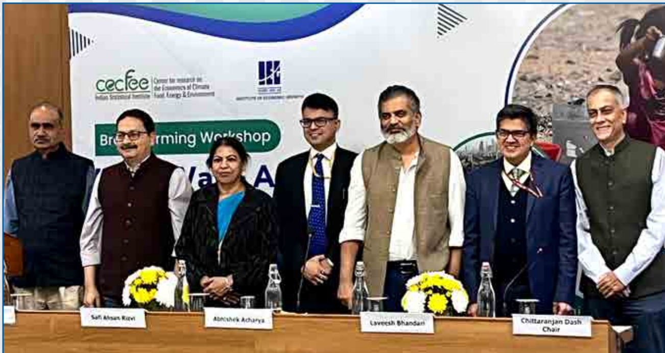
Brainstorming Workshop on “Heat Adaptation Interventions for Slum Dwellers” held on November 27, 2024