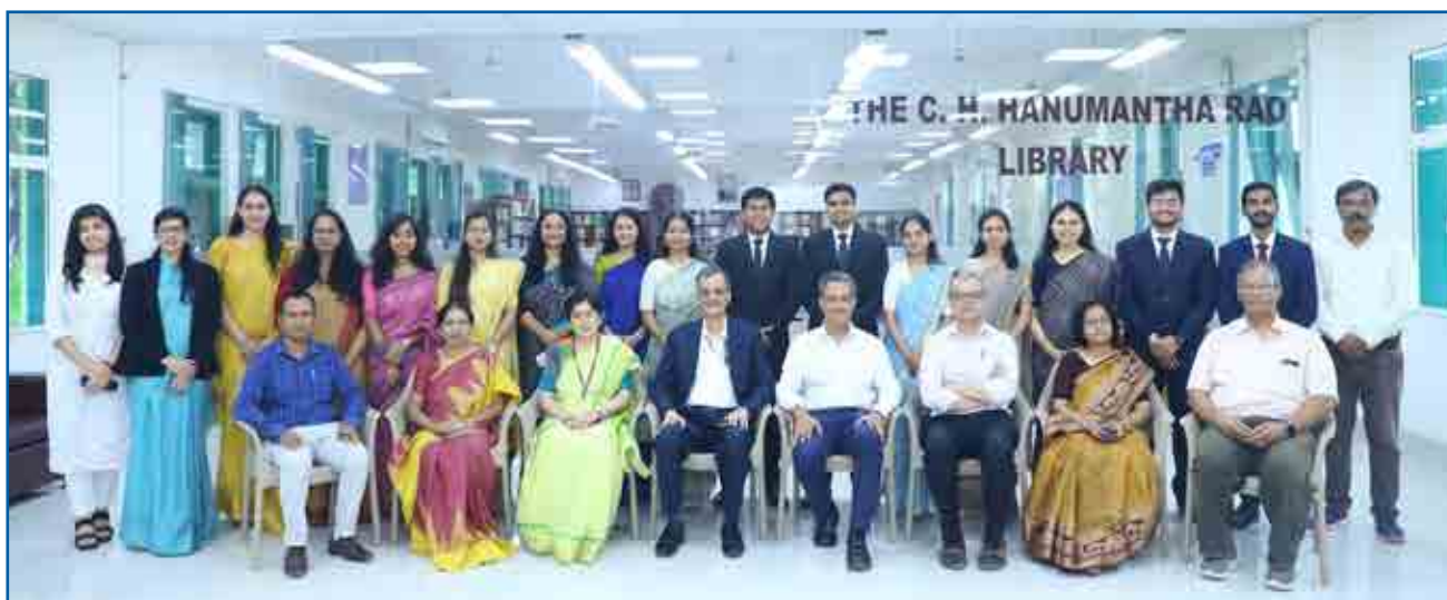
IES Batch 2024- Inaugural Session