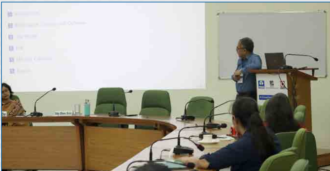
"Workshop on Finance and Markets" held on April 15-16, 2024