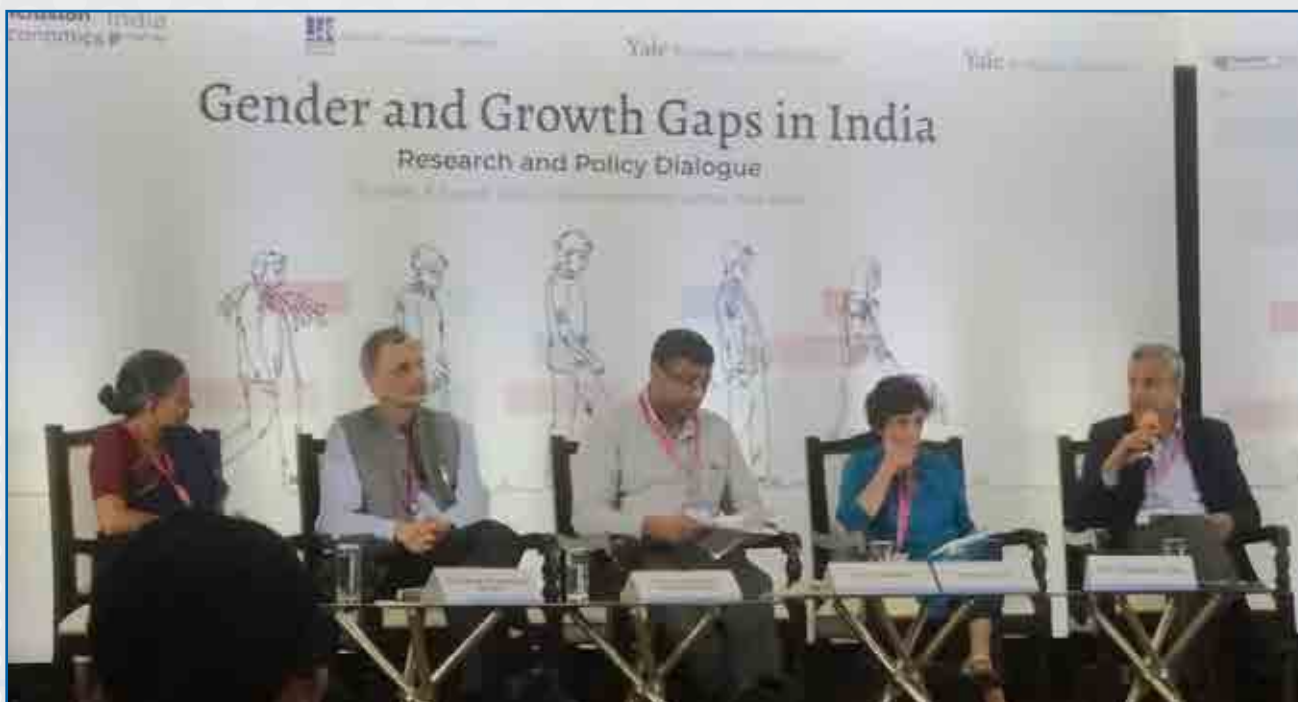
“Gender and Growth Gaps in India – Research and Policy Dialogue 2024” organized in collaboration with Yale Inclusion Economics and Inclusion India Economic Centre on August 8, 2024.