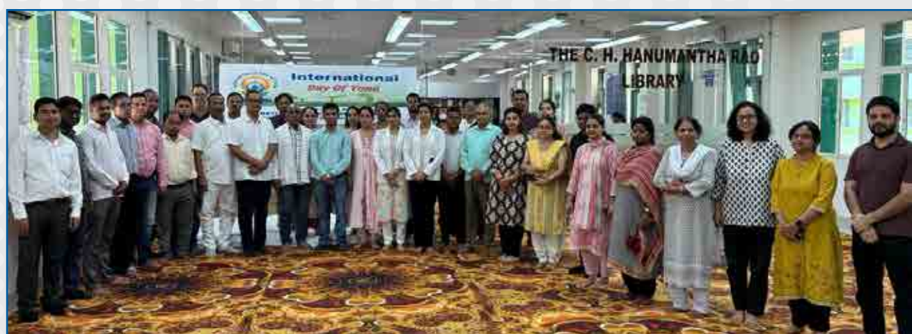
International Yoga Day was celebrated on June 12, 2024