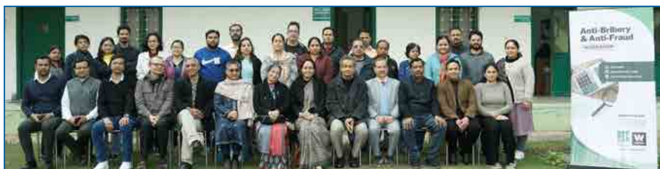
“Workshop on Anti-Bribery and Anti-Fraud Policies,” held on December 20, 2024