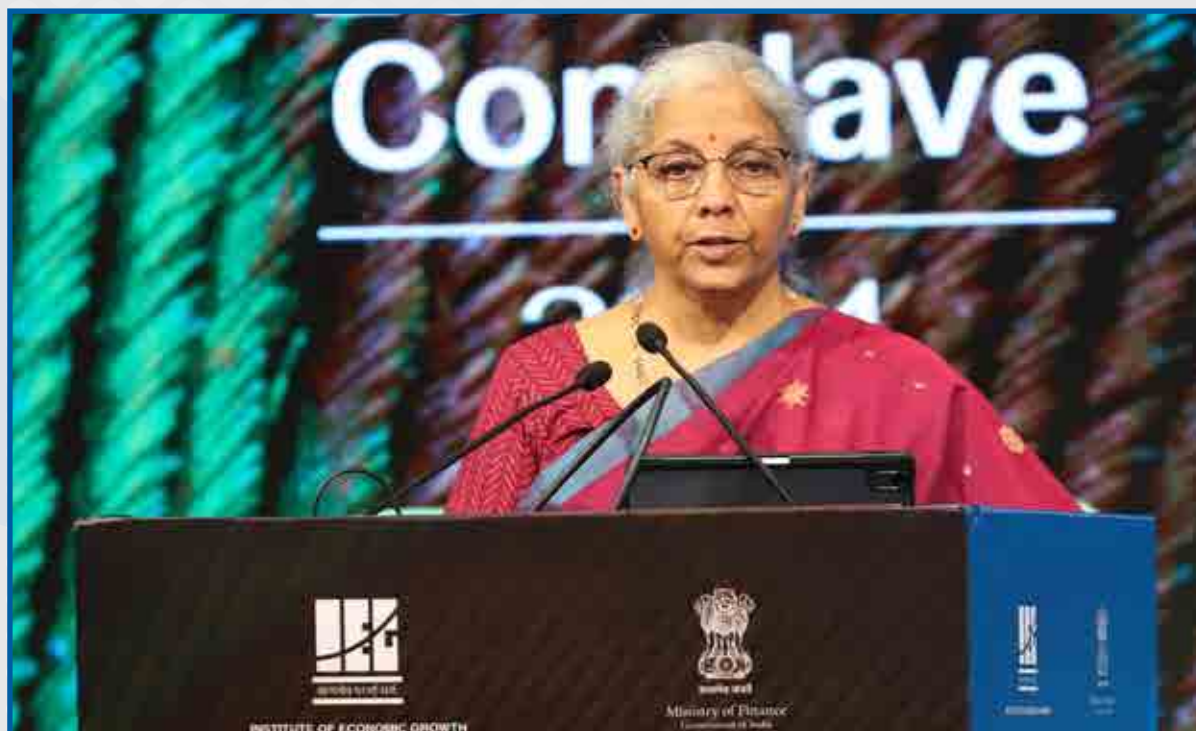
Hon'ble Finance Minister, Smt. Nirmala Sitharaman at KEC 2024 - Inaugural Address