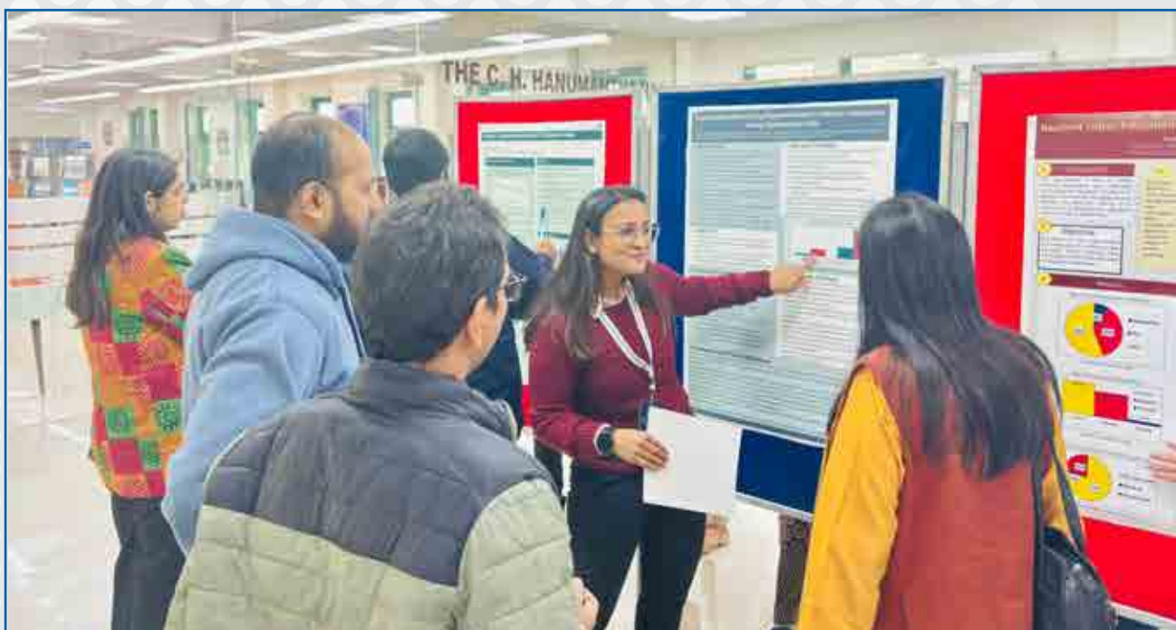
Poster Session by the Participants of IEG Winter School- 2024