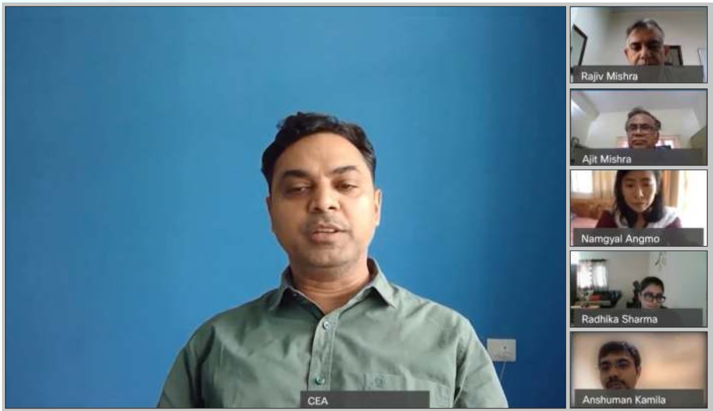
KV Subramanian, Chief Economic Adviser (CEA) interacting with IES probationers. (August 3, 2020)