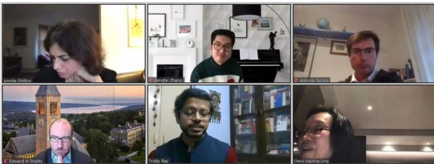
Eminent scholars attending the Law and Economic Development, International Economic Association (IEA) Workshop, January 21-23, 2021