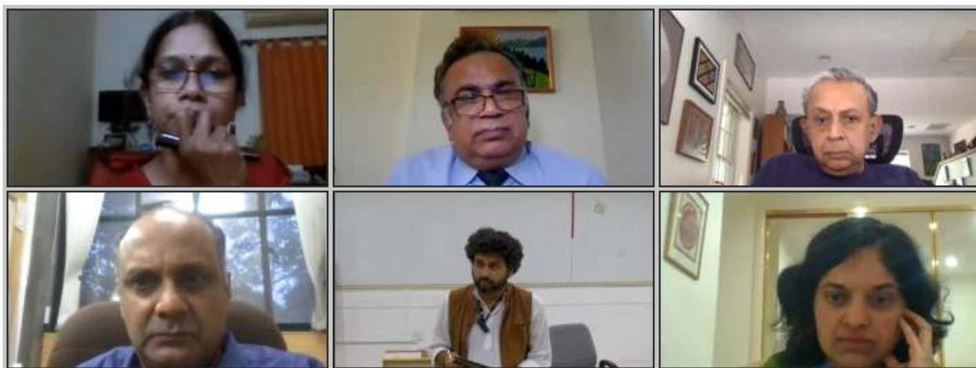
Society for Economic Research in India (SERI) Sixth Annual Workshop, July 7-10, 2020, at the IEG and Centre for Development Economics, Delhi School of Economics