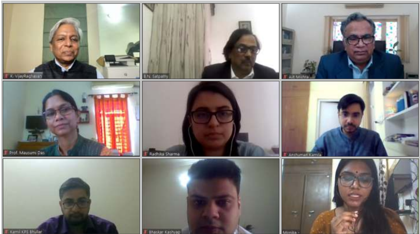
(Top Left) K. VijayRaghavan (Principal Scientific Adviser PMO) on ‘The Role of Science and Technology’, Talk to IES OTs (March 2, 2021)