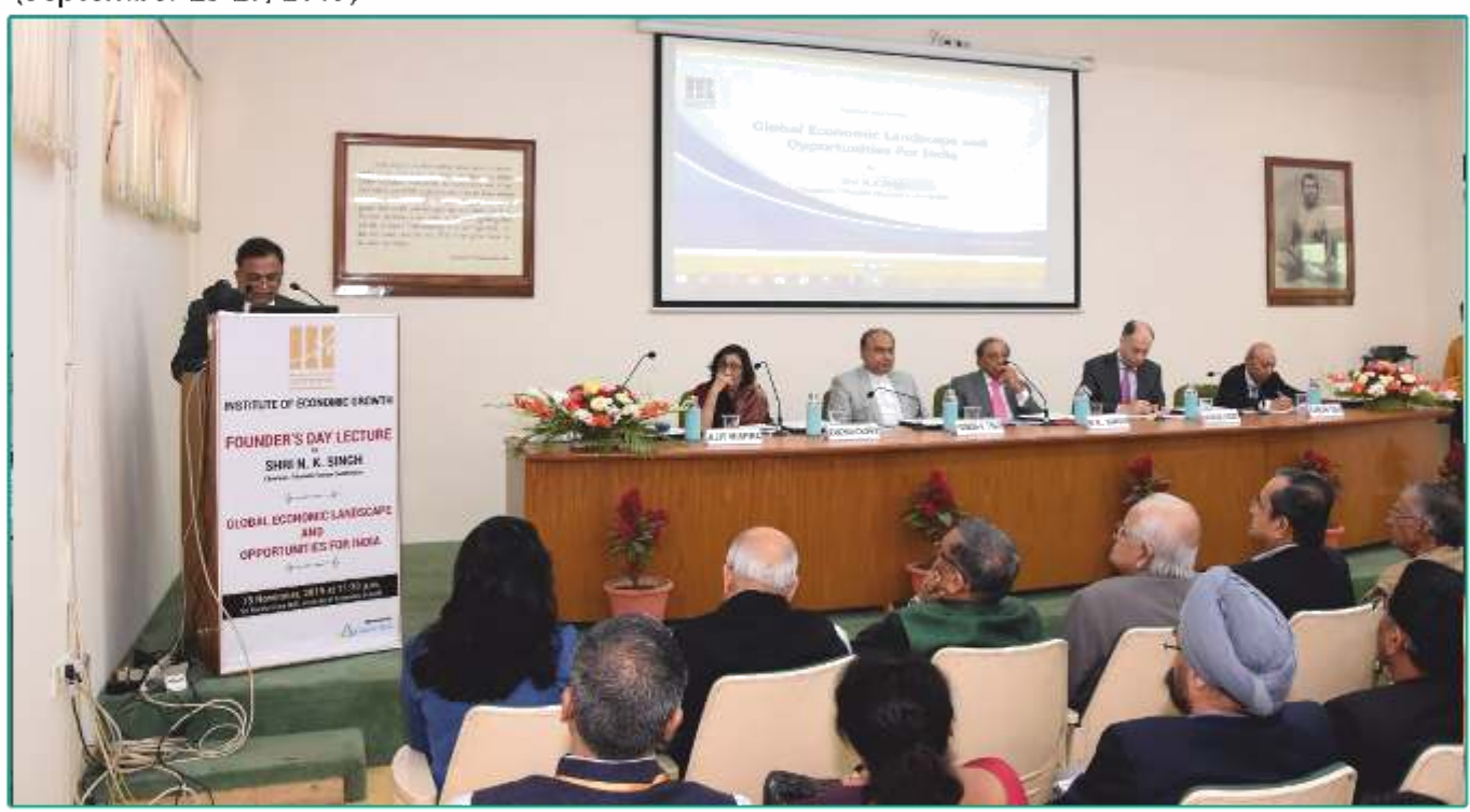
Director welcoming the distinguished guests on the Founder's Day. (November 15, 2019)