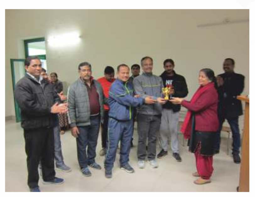
Volleyball Match winners