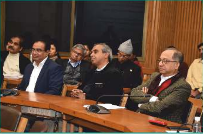
Workshop on 'Understanding Developmental Impacts of Dams: Ex-post and Ex-ante Analysis', (January 14-16,2020)