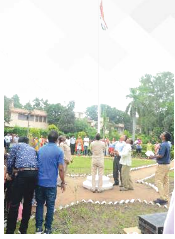
Flag Hoisting on 15 August, 2019