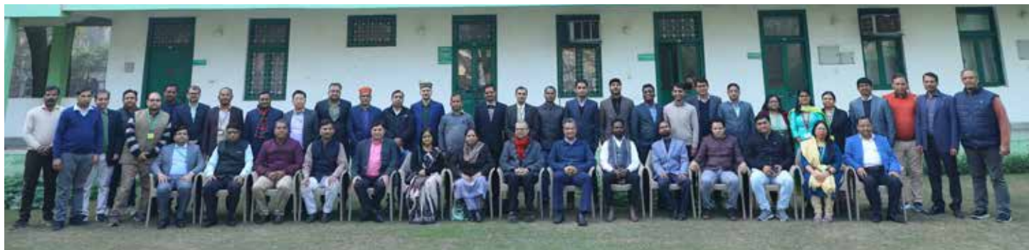
Group Photograph of IES Promotee Officers Training Programme (2 February, 2024)

The training programme for the 34 IES Promotee Officers was started from January 22, 2024 and continued till February 2, 2024.