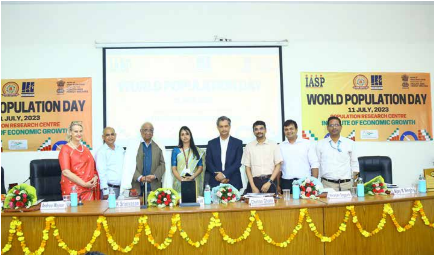
World Population Day celebrated on Tuesday (July 11, 2023)