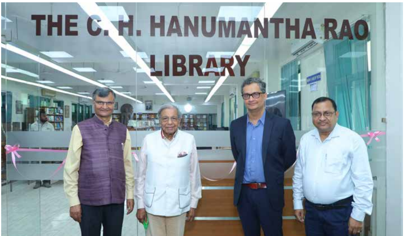
Renaming of IEG Library as the C.H. Hanumantha Rao Library (July 7, 2023)