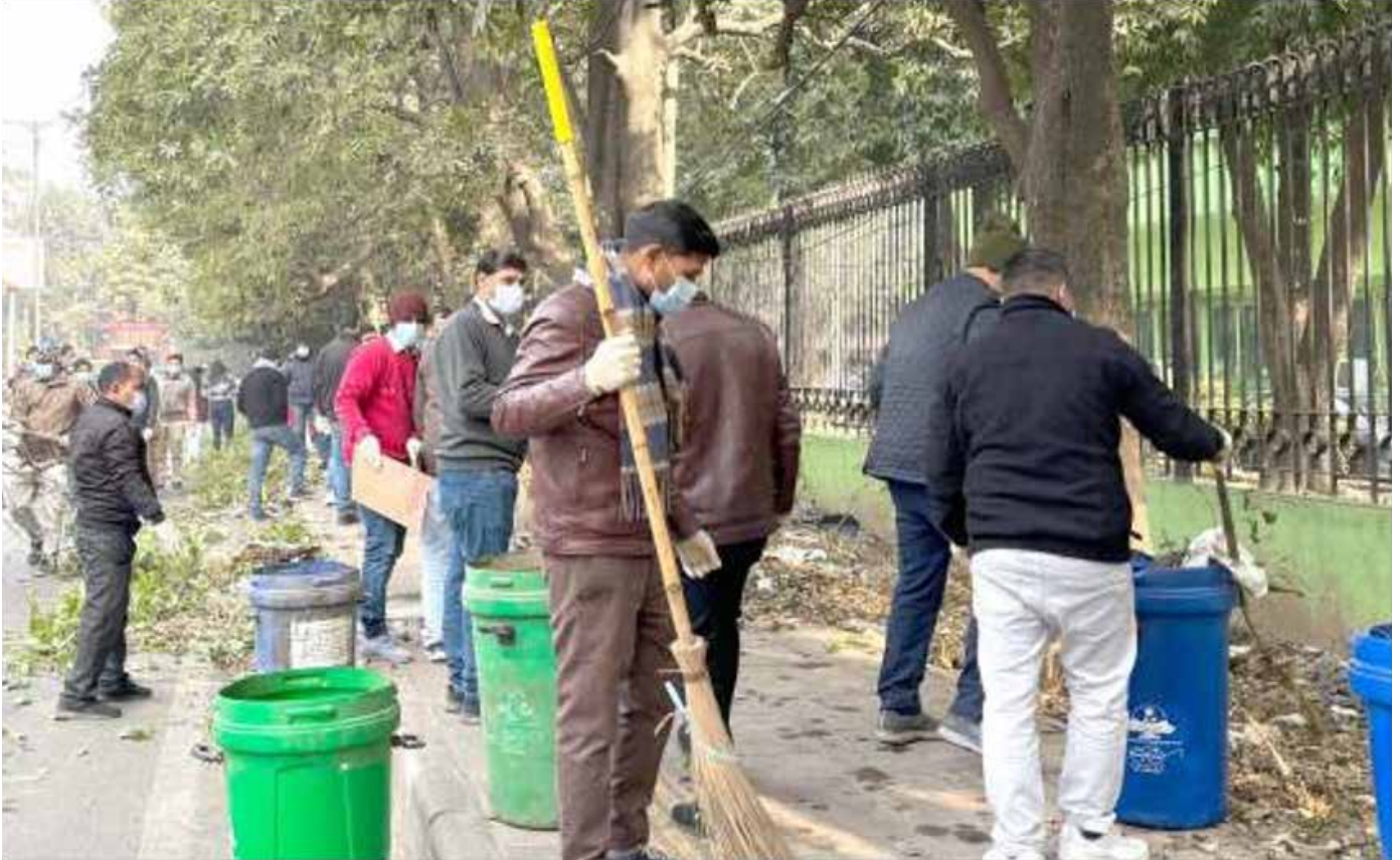
IEG Staff participating in Swachh Bharat Abhiyan (23 January 2024)