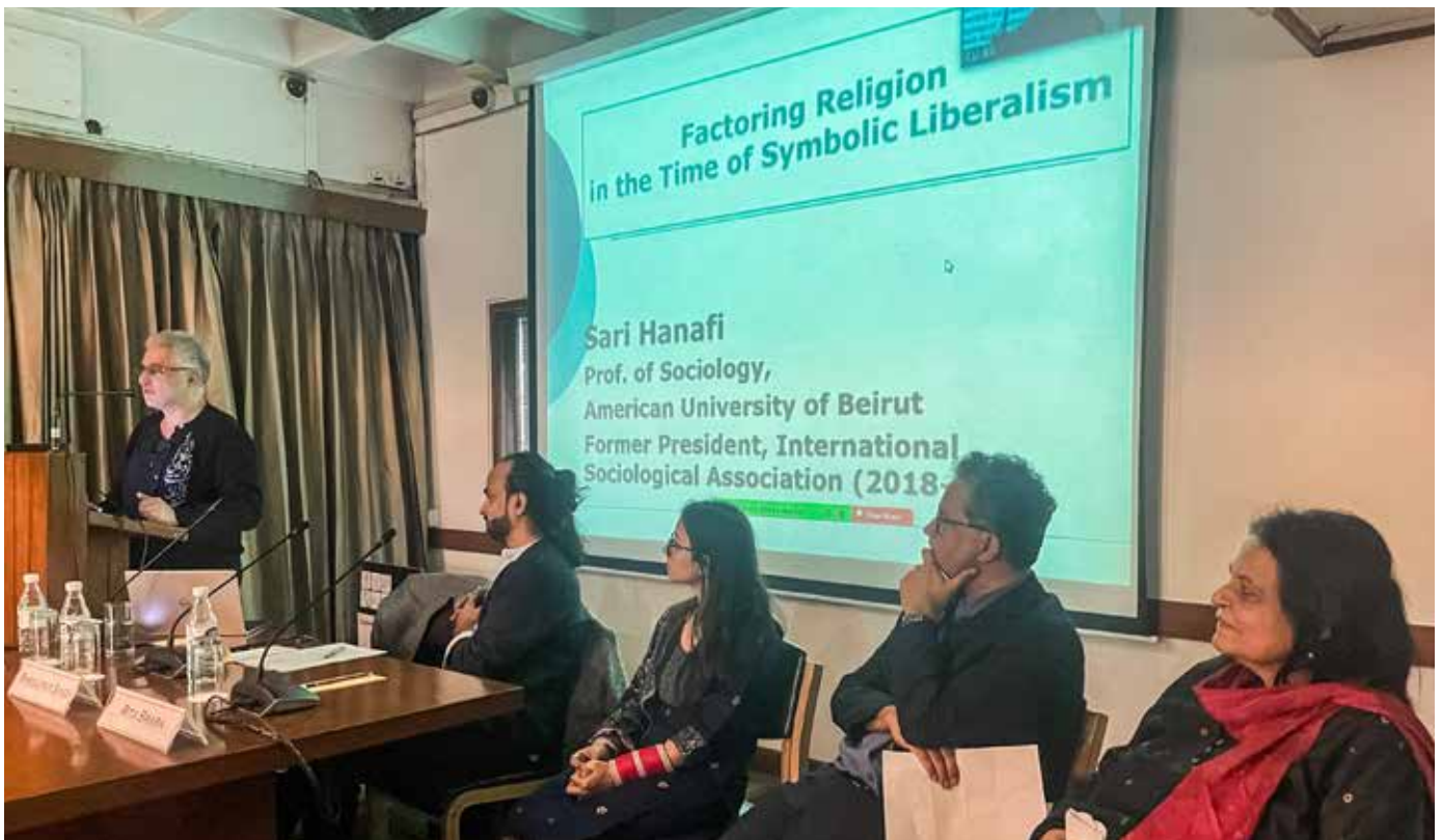
CIS IEG Sage Annual Lecture (December 9, 2023)