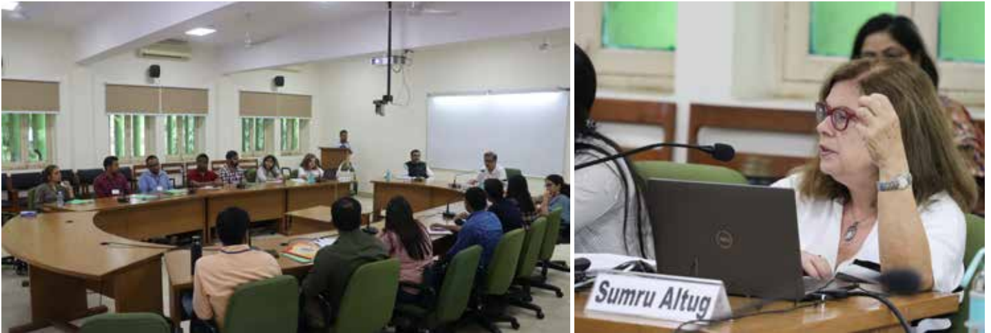
Training Workshop on 'Advanced Topics in Macroeconomics' (October 25-27, 2023)

This workshop was organised to teach the formulation and analysis of models with market incompleteness in a dynamic stochastic environment and to enhance students' understanding of dynamic economic equilibrium under non standard assumptions. The audience of this workshop were RBI and IES officers, junior faculty in economics, and currently enrolled M.A. and Ph.D. economics students. This training workshop was attended by more than 50 research scholars from Delhi School of Economics, University of Delhi; Indian Statistical Institute (ISI); Shiv Nadar University; North Eastern Hill University, Shillong, Meghalaya; Babasaheb Bhimrao Ambedkar University (central university in Lucknow); University of Lucknow; Indira Gandhi Institute of Development Research (IGIDR), Mumbai; Vijayanagara Sri Krishnadevaraya University, Karnataka; South Asian University; IIT Trichy; and The Gandhigram Rural Institute.