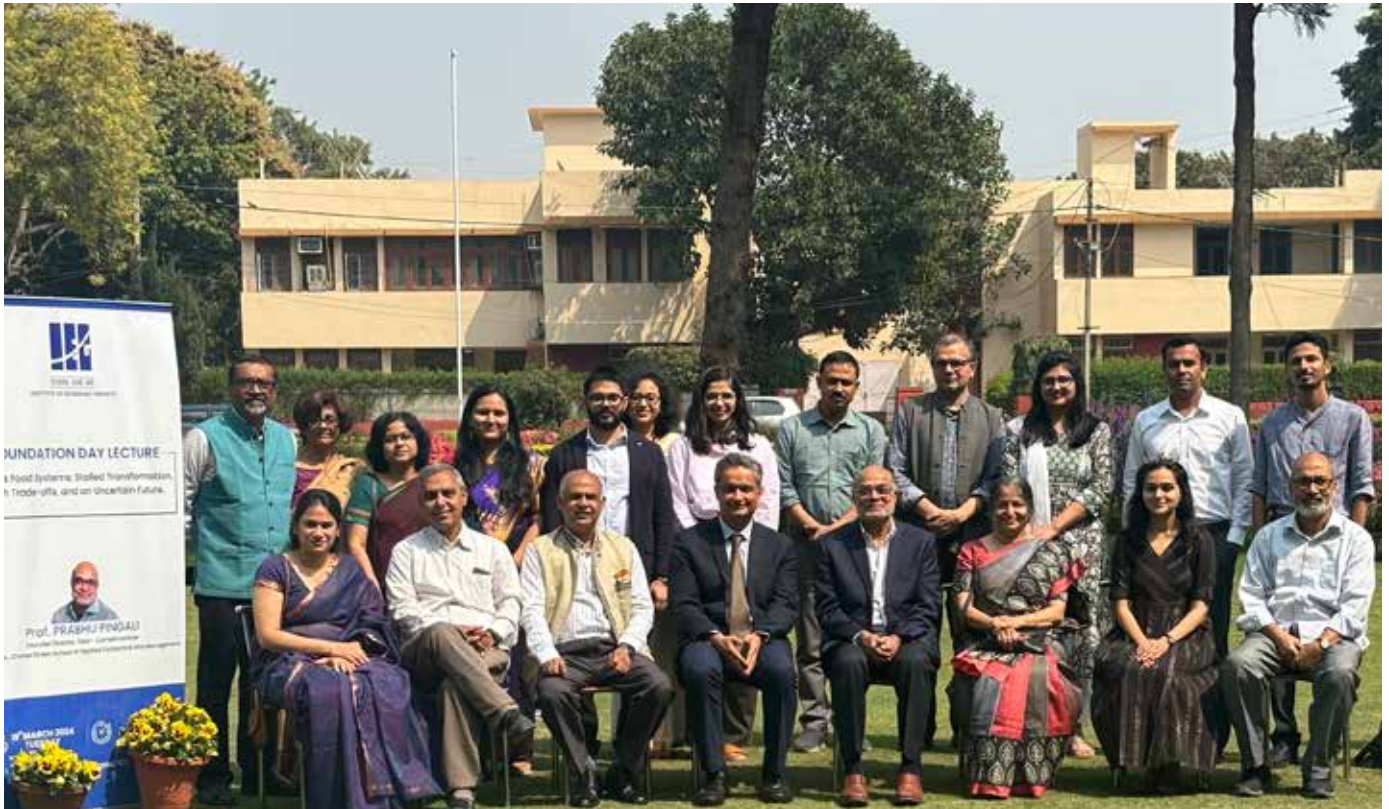
Foundation Day lecture (March 19, 2024)