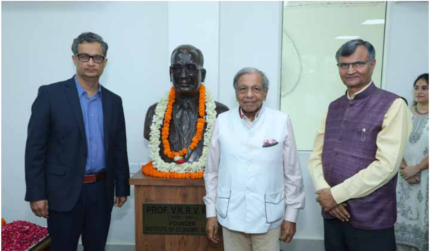
Inauguration of the bust of Prof V.K.R.V. Rao (July 7, 2023)