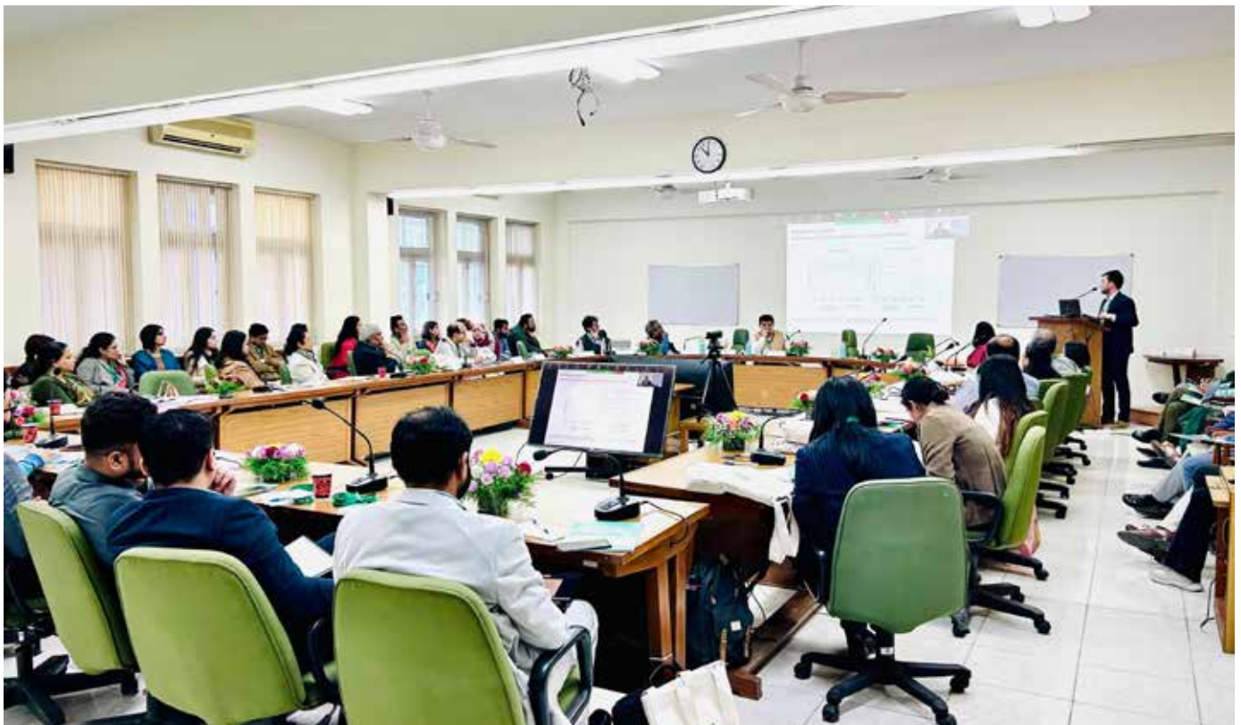
Consultation Meeting on HFSS Food (December 14, 2023)