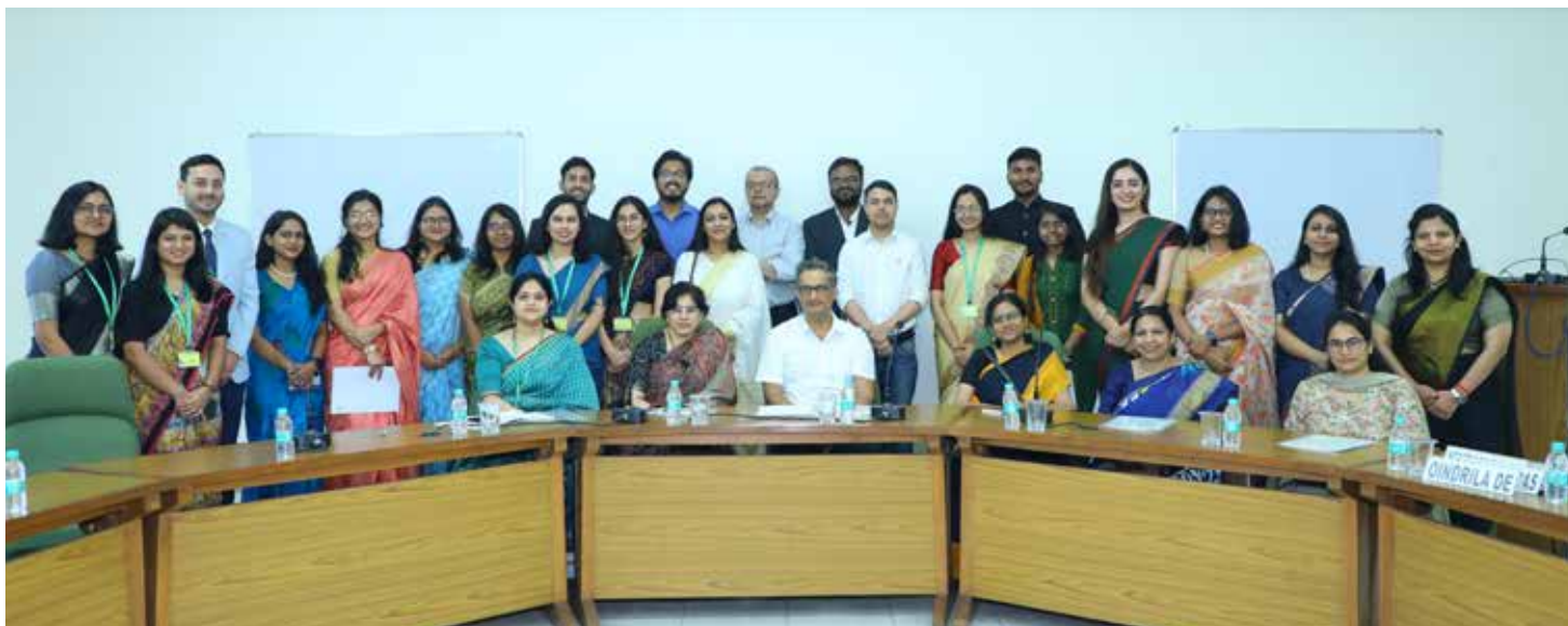
Valedictory Function of IES Officer Trainees Batch 2023 (September 29, 2023)